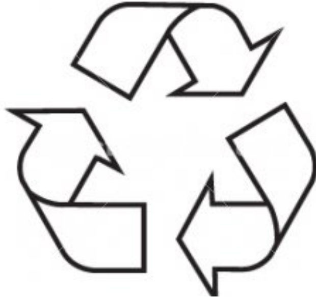
EXHIBIT 3 “Please Recycle” Symbol and Statement