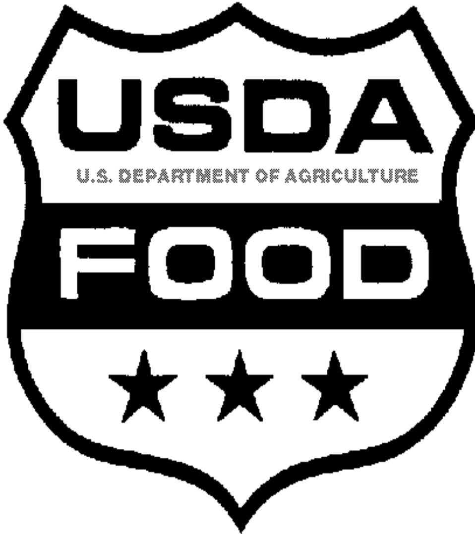
EXHIBIT 4 USDA Symbol